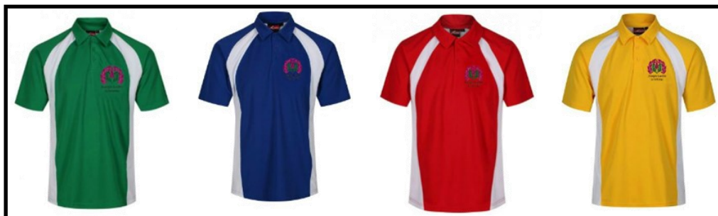
Joseph Leckie House Polo Shirt