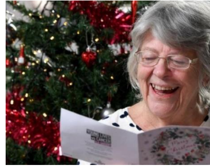
2020 Kindness entries